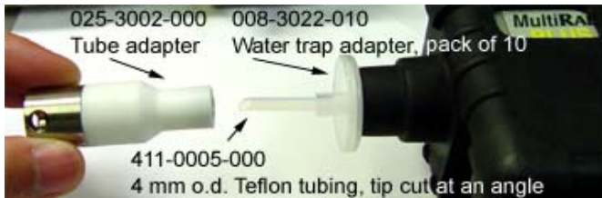
Connection to Multi-gas monitors